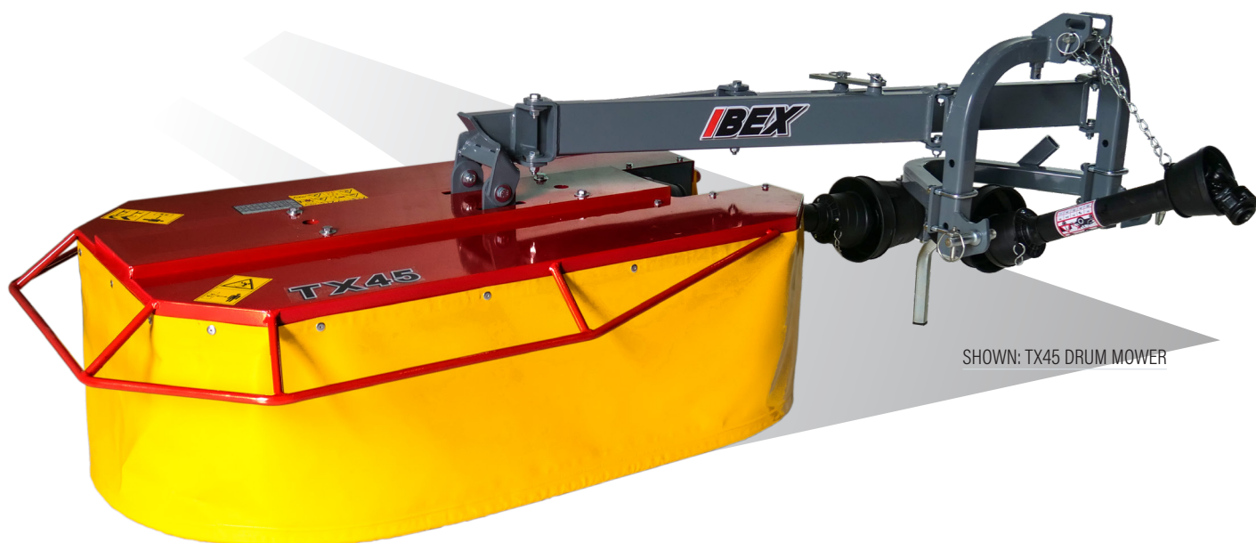
SHOWN: TX45 DRUM MOWER