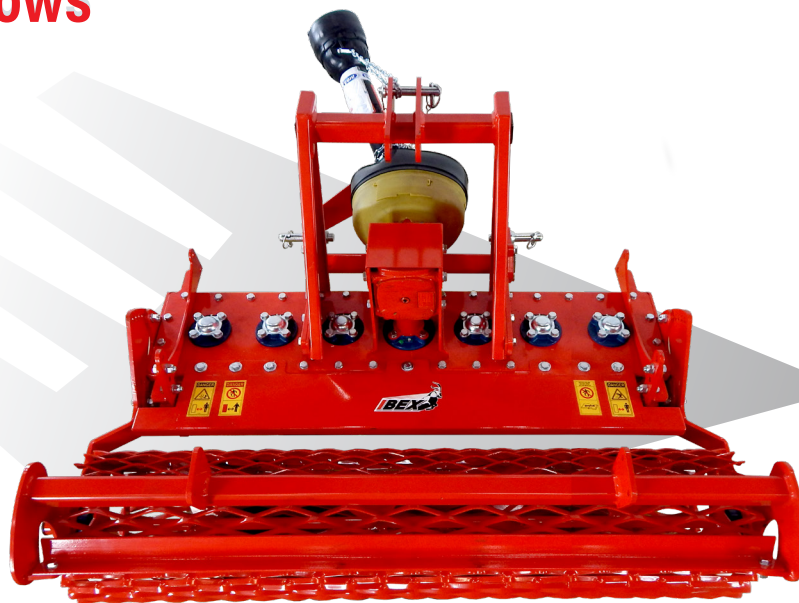
SHOWN: TS52 POWER HARROW