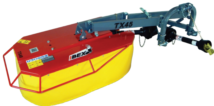
IBEX TX45 COMPACT DRUM MOWER