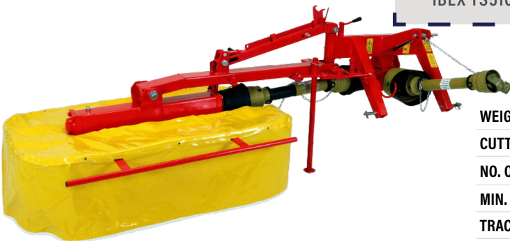
IBEX TS51C DRUM MOWER WITH CONDITIONER