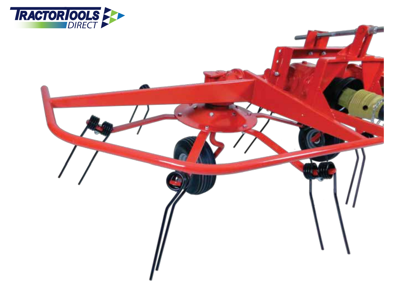
Figure 3 right side

The wing guards are installed by taking 2 bolts out of the castings on each side, then replacing with the guard attached.