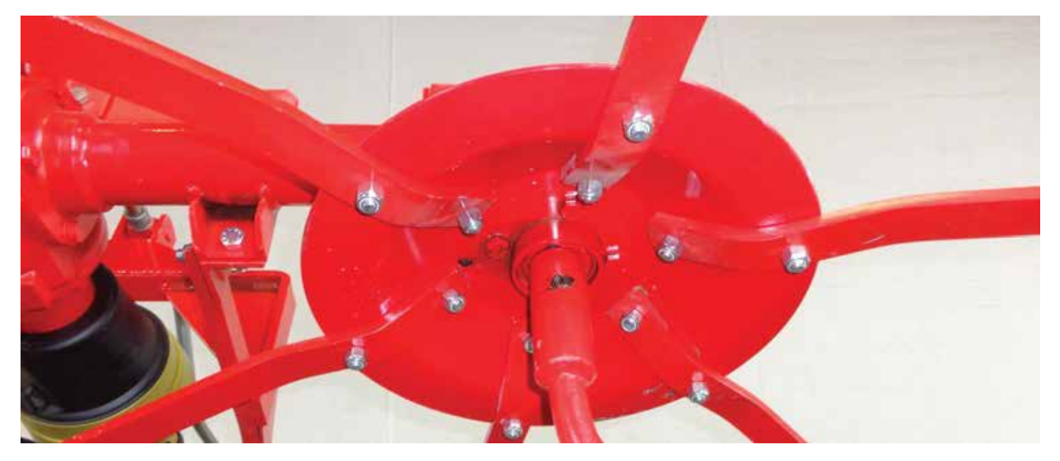
Figure 6 arms attachment

A socket will clear the spring to tighten the nut.