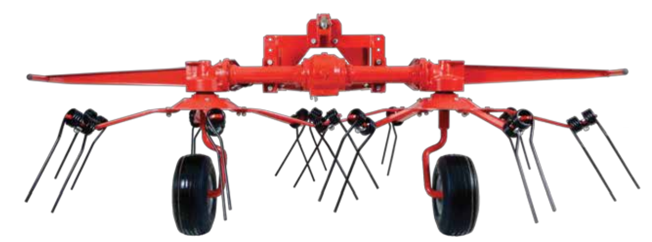
Figure 1 rear view