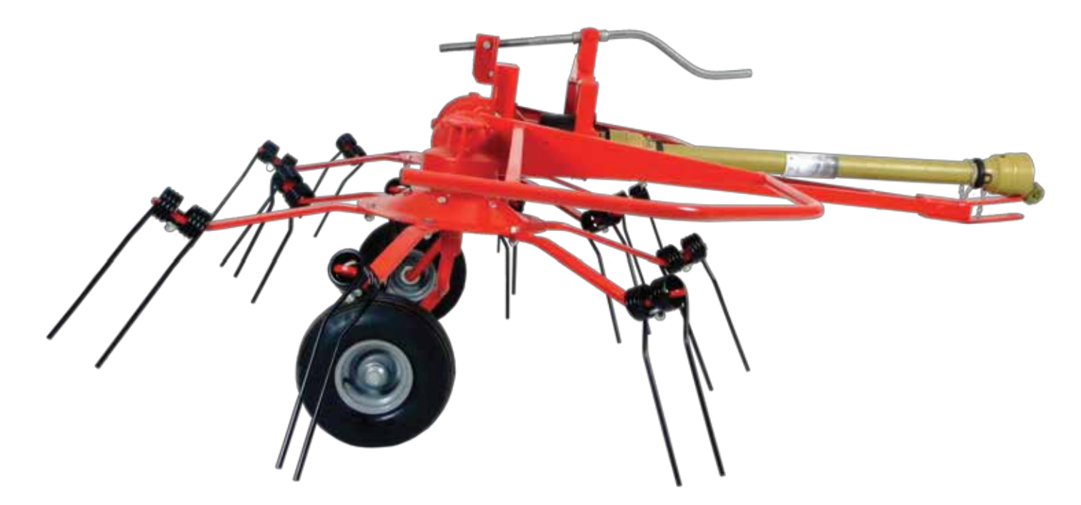
Figure 4 side view for reference

The wing guards are installed by taking 2 bolts out of the castings on each side, then replacing with the guard attached.